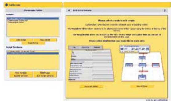
Interaction Dialer's advanced Interaction EasyScripter scripting tools.